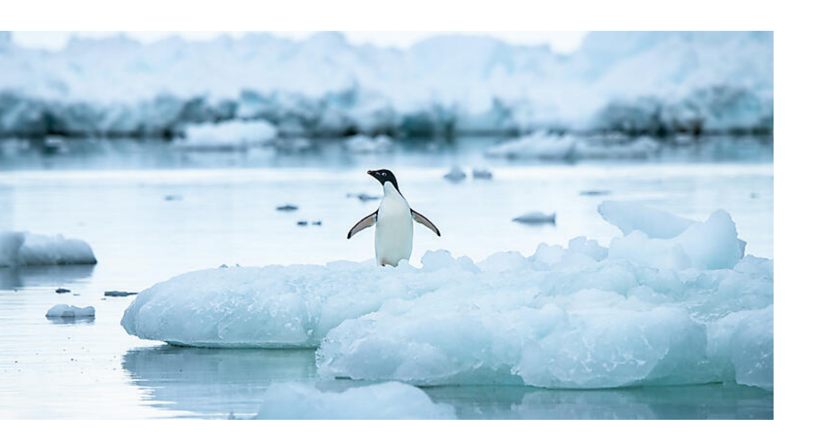
The information in this document is valid as of 19/04/2024